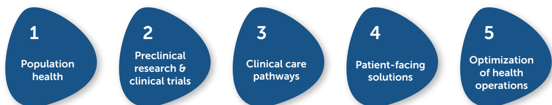
Figure 1: Top 5 use cases for AI in health