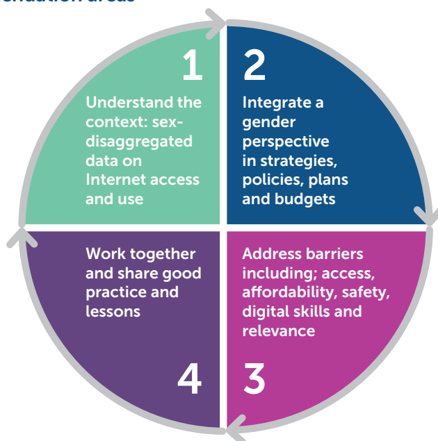
Figure 1: Recommendation areas